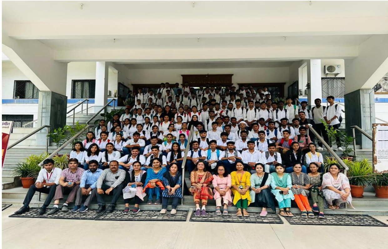
FY-Induction Program 203-2024 From 03 July to 08 July 2023